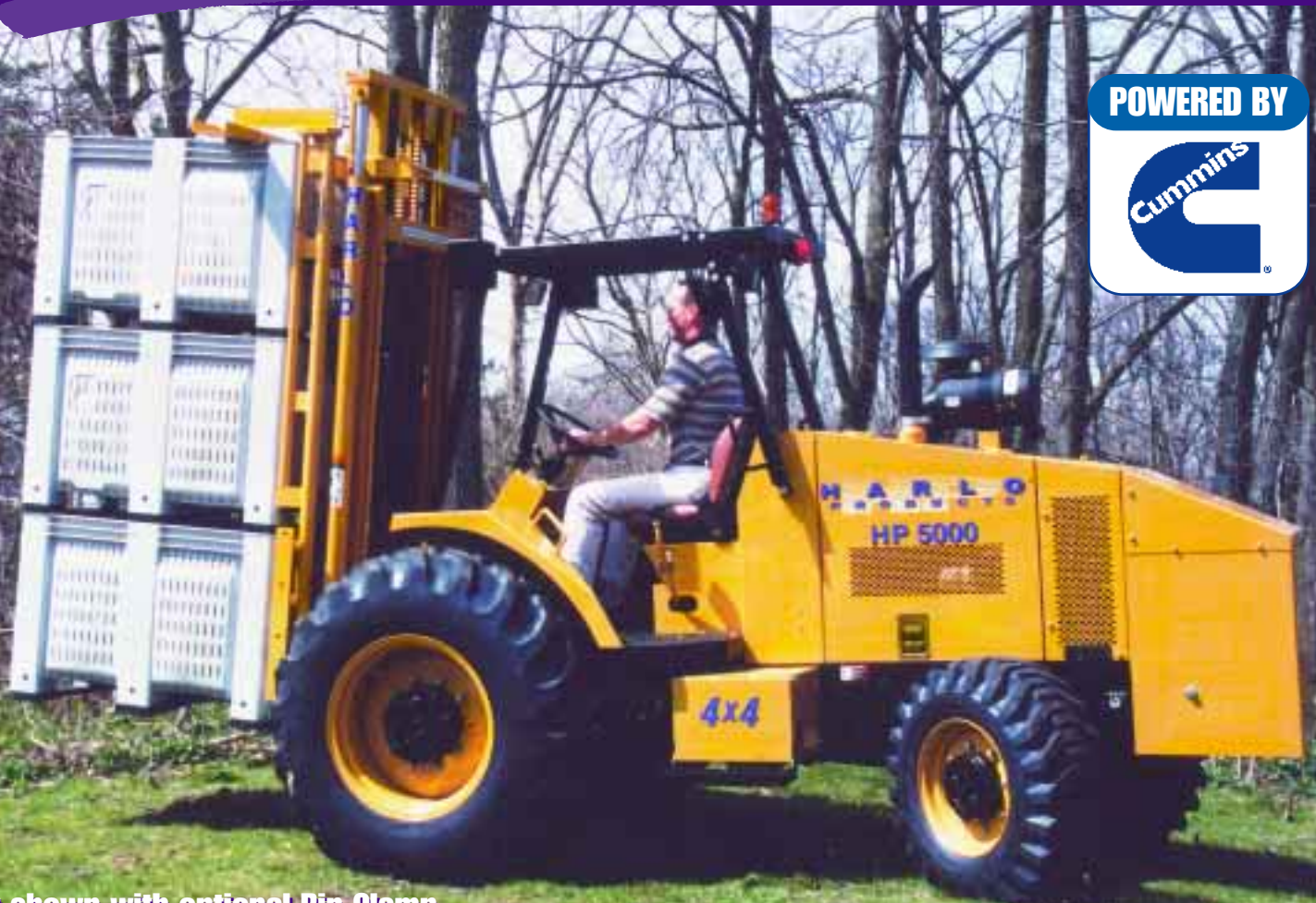
Unit shown with optional Bin Clamp